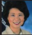
ELAINE CHAO Secretary United States Department of Education