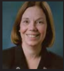
JO ANNE BARNHART Commissioner United States Social Security Administration