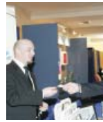
EXHIBIT BOOTH SPONSOR: